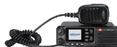
TM840 DMR MOBILE RADIO

For more information, please visit www.kirisun.com or contact marketing.os@szkirisun.com