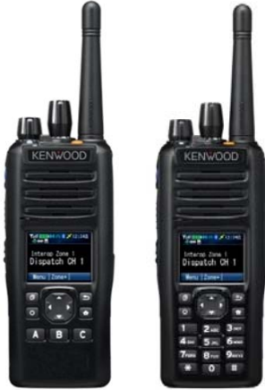
<Standard Key Model > <Full Key Model >

700/800MHz Digital & FM Analog Portable Radio