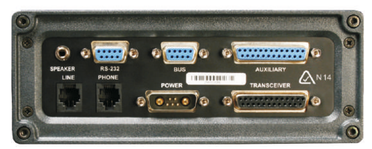
Barrett 2060 HF Telephone interconnect rear panel

98 pre-programmed telephone numbers stored in the 2060 can be accessed by HF manpacks, vehicles or base stations that only have Selcall and not the full dial Telcall option fitted.