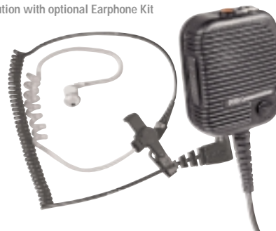
Evolution with optional Earphone Kit