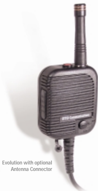
Evolution with optional Antenna Connector