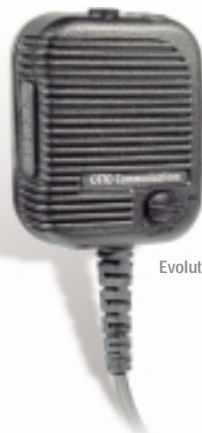
Evolution H 2 O